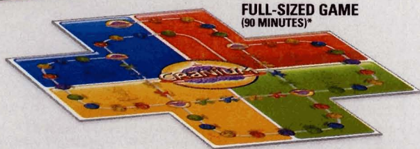
FULL-SIZED GAME (90 MINUTES)*

*This is our best guess. Actual game times may vary depending on luck, adequate and/or distracting snacks, and the overall brilliance of the players.